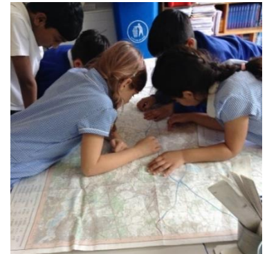
Map reading Ordnance Survey maps.