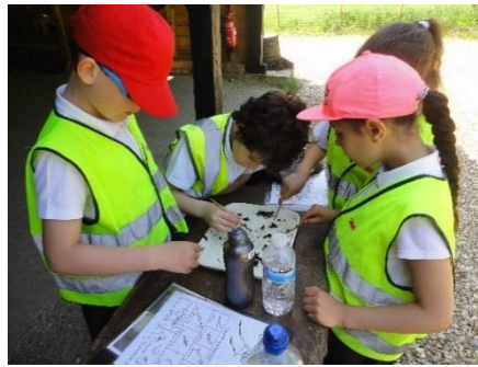
Dissecting owl pellets to explore different skeletons.