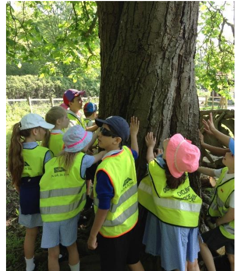
Discovering the feel of the bark on different trees.