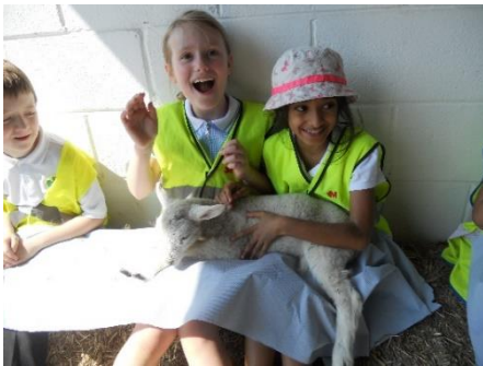
Holding Lambs on the farm.