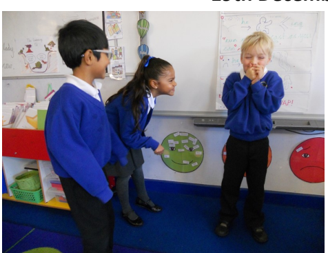
Year One acted out the Gingerbread Man