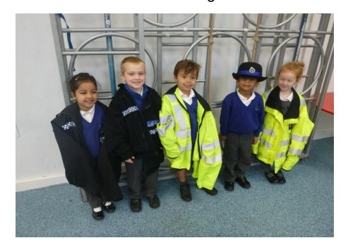
Foundation were finding out about the role of a